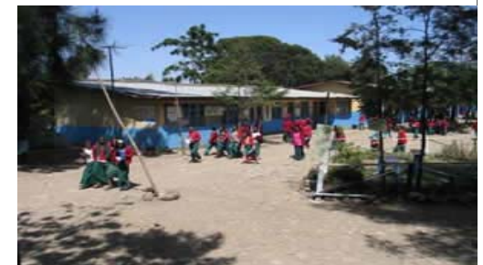
Fitawrari Lake Adgeh Primary School